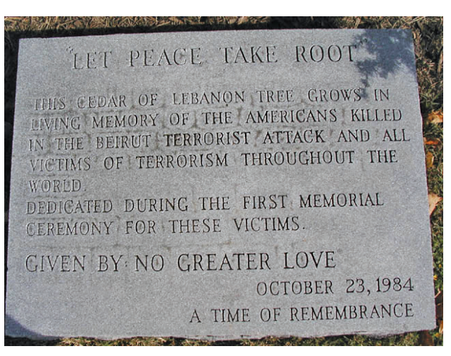
Beirut Barracks Memorial, Arlington National Cemetery, Section 59

"That Marine and all those others like him, living and dead, have been faithful to their ideals. They've given willingly of themselves so that a nearly defenseless people in a region of great strategic importance to the free world will have a chance someday to live